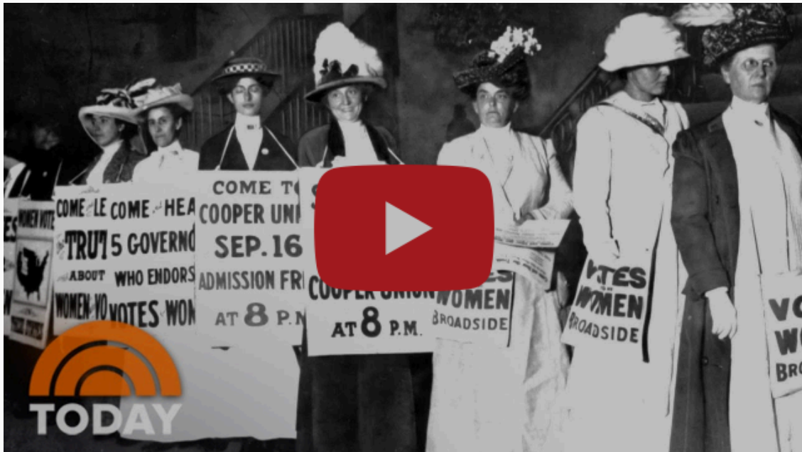
The Today Show Recognizing the Roles of Women Throughout American History