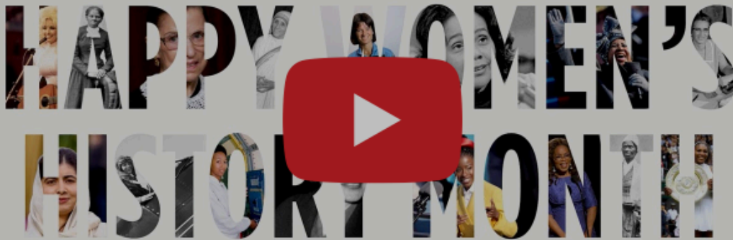
The Obama Foundation Happy Women's History Month