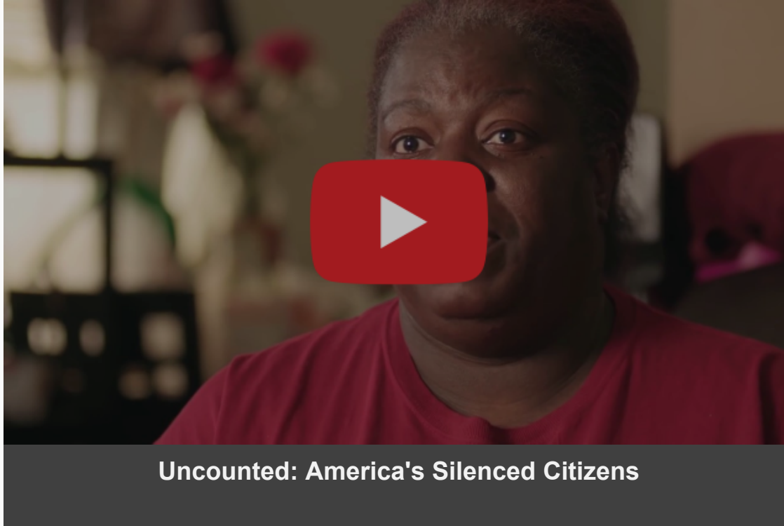
Uncounted: America's Silenced Citizens