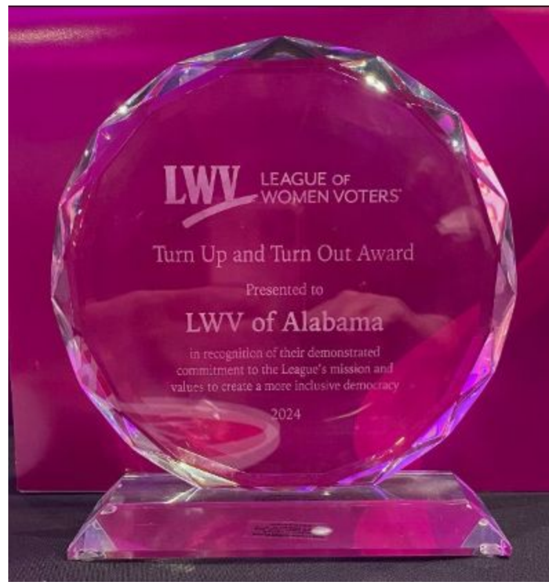
The award inscription: "Presented to LWV of Alabama in recognition of their demonstrated commitment to the League's mission and values to create a more inclusive democracy".

Look for more specific detail on convention business and personal recaps by delegates in an upcoming LWV member communication.