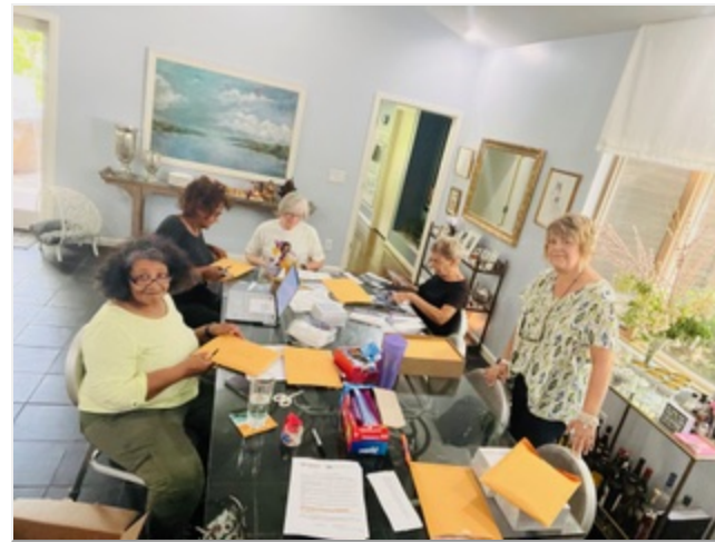
LWV of Greater Birmingham members prepping postcard packages to go out to volunteers.

The League's ambitious GOTV project is underway and already successful. We are writing 27,000 postcards to voters in Alabama's Congressional District 2 to remind and encourage them to vote.